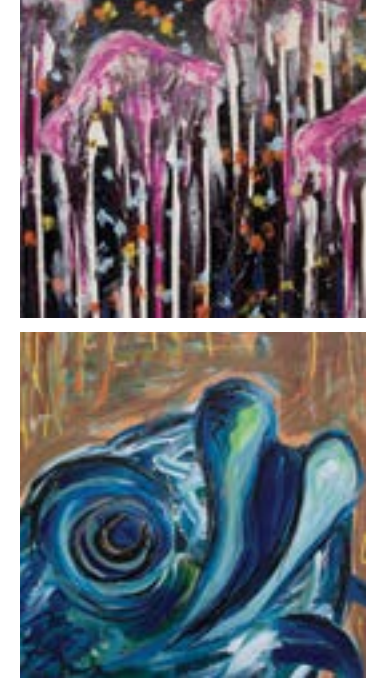
Paintings by Devon Govoni '05