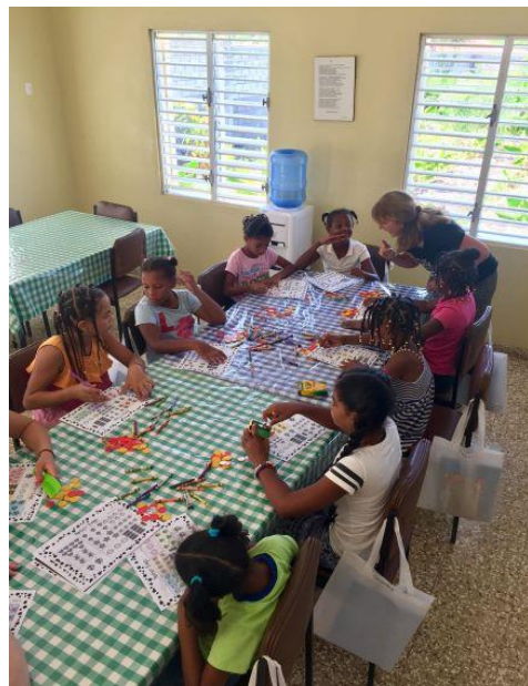
School in the Dominican Republic for girls