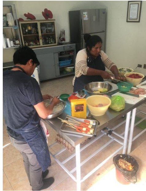
Social enterprise initiative in Bolivia

Six travel grants were awarded to students who traveled to the Dominican Republic; Beirut, Lebanon; Tamil Nadu, India; Bolivia; Prague, Czech Republic; and Paris, France, for work in the areas of public health, environmental advocacy, language exchange, education, and social enterprise. Eleven internship grants were issued to students for unpaid summer internships at the White House, Norfolk (MA) District Attorney's Office, US State Department, Massachusetts Governor's Office, Boston Children's Hospital, and various non-profit organizations in Argentina, India, South Africa, Connecticut, Massachusetts, and Washington, DC.