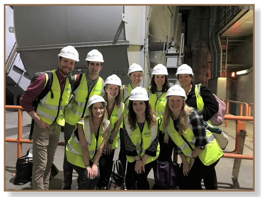
Touring the Haymarket Vent Building

The Fellows also toured the Massachusetts Bay Transportation Authority (MBTA) Control Room; Fenway Park, to better understand the private and public relationships of the Red Sox and the City of Boston in regard to vendors, street closings, and air space; MCI-Cedar Junction; Haymarket Vent Building (the Big Dig tunnel); and the Moakley Courthouse, where the Fellows participated as court clerks in a Discovering Justice mock appellate argument program for middle school students.