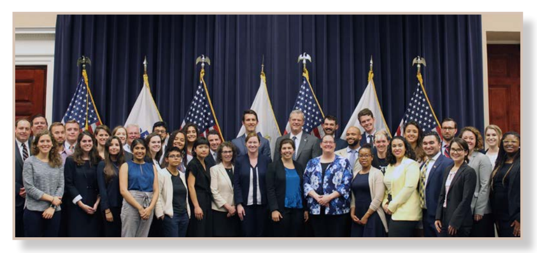
The Rappaport Center and Institute Fellows with Massachusetts Governor Charlie Baker