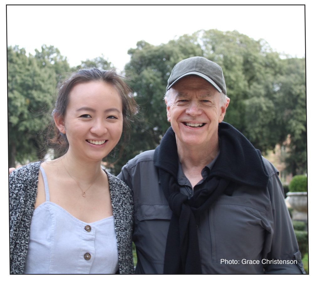
Con't on page 3